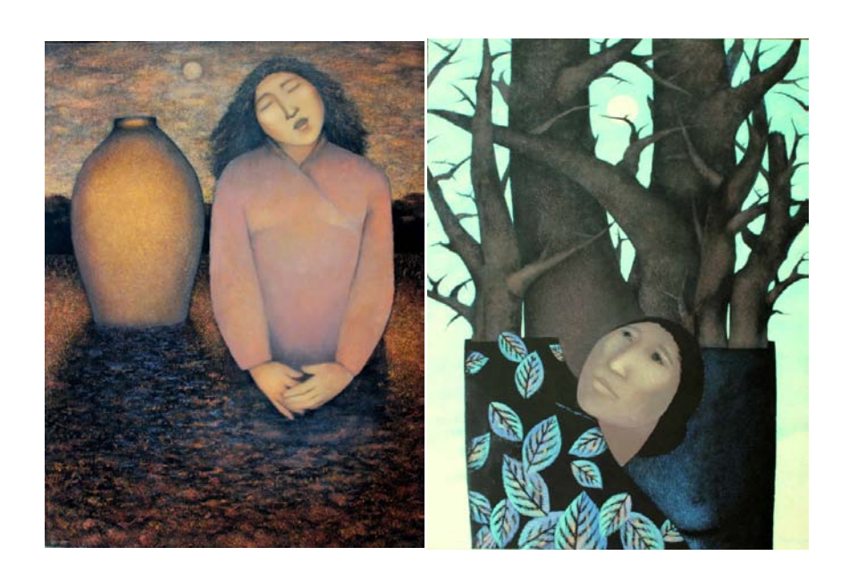
Song of the Sea & My Mother's Garden © by Lee Lawson

helped me imagine my brain neurons growing as strong as tree trunks. The Song of the Sea encouraged me to sing my own unique song and walk my own unique path. It is so vital to find your own voice and speak your own truth.